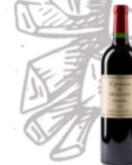
L'ESPÉRANCE DE TROTANOY, POMEROL 2011

Second wine to Château Trotanoy, first released in 2009. Rich, voluptuous and complements all red meats, especially lamb.