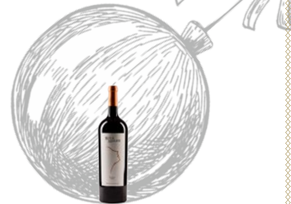
MALBEC, BODEGA RUCA MALEN MAGNUM 2014

Indulge yourself with this premium example of Argentina's signature Malbec grape, in a format that suits it well. Silky, moreish and lingering.