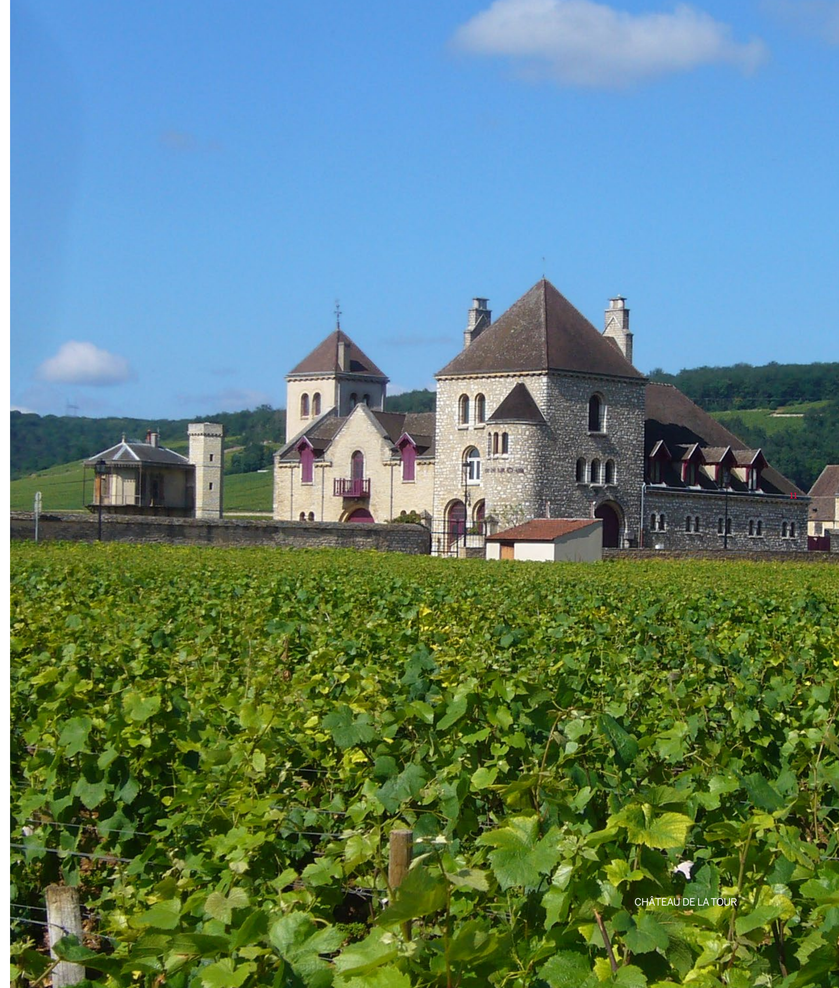
CHÂTEAU DE LA TOUR

Once fermentation ends, the wine is racked off immediately into barrel to avoid any astringency in these most robust of Pinot Noirs. Around 50% new oak is used for the Cuvée Classique and 100% for the Vieilles Vignes and Hommage.