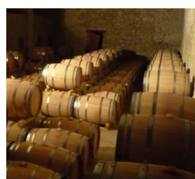
Cellar at Tertre Roteboeuf