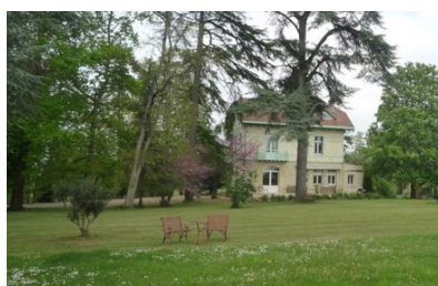
Domaine de L'Aurage