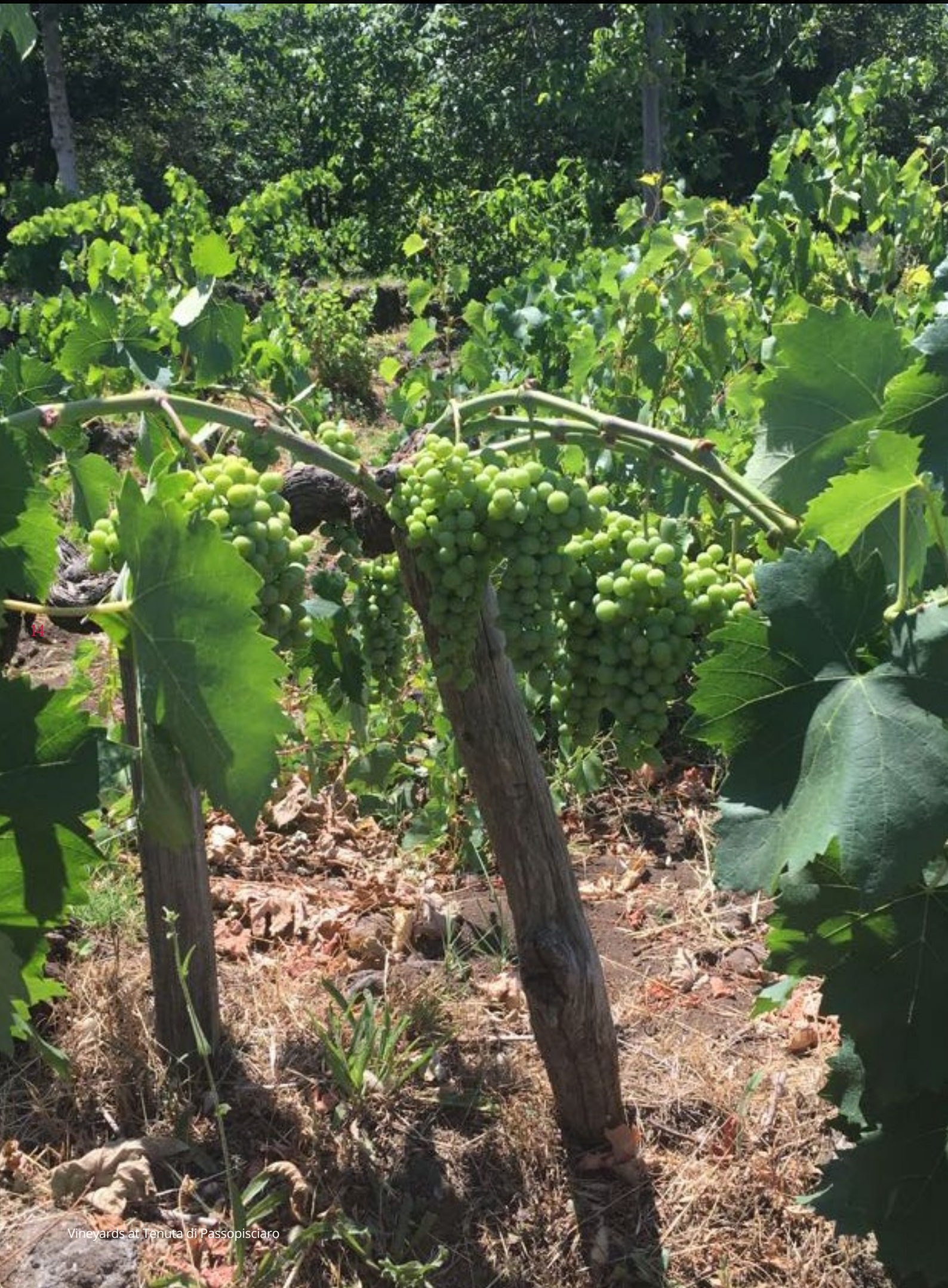
Vineyards at Tenuta di Passopisciaro